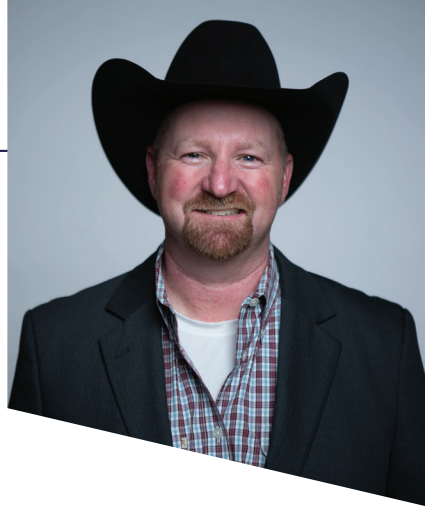
President and CEO G-Force & Associates, Inc.

“Working safe is about treating each person at G-Force as a member of your family. We will not ask anyone to do anything that I wouldn’t have a family member or myself do. Our leadership is committed to operating with the highest safety standards and continuously training our employees to ensure jobs are done safely each and every time.”